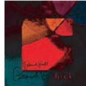
DIRK K -Beach Ball 1994