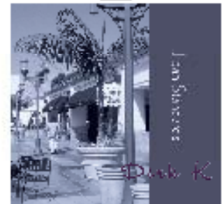
DIRK K -Urban Standards 2000